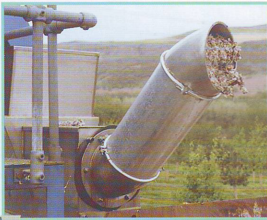
CP 240 Compactor